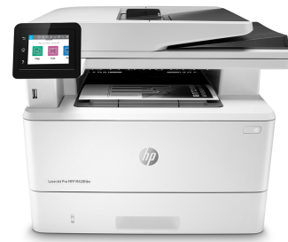
HP LaserJet Pro MFP M428fdw

Dynamic security enabled printer. Only intended to be used with cartridges using an HP original chip. Cartridges using a non-HP chip may not work, and those that work today may not work in the future. Learn more at: http://www.hp.com/go/learnaboutsupplies