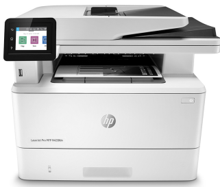
HP LaserJet Pro MFP M428fdn

Winning in business means working smarter. The HP LaserJet Pro MFP M428 is designed to let you focus your time where it's most effective – growing your business and staying ahead of the competition.