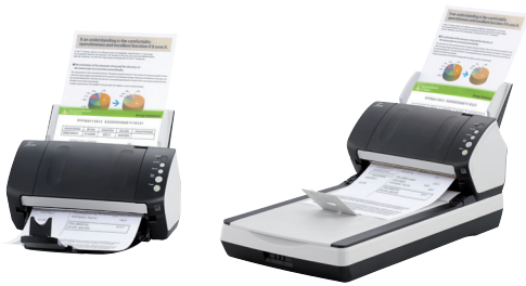
fi-7140 / fi-7240 – A4 Portrait at 300 dpi 40 ppm / 80 ipm Scan mixed batches through the 80 sheet ADF