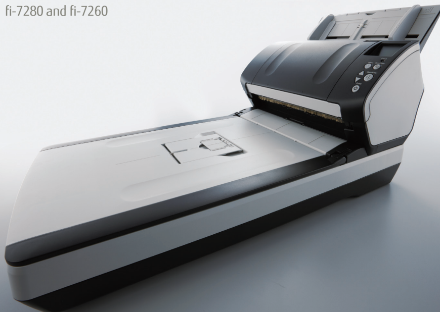
fi-7280 and fi-7260

Carrier sheets allow you to scan documents, larger than A4 or photos and clippings that are at risk of being damaged when processed through an ADF. {Part Number – PA03360-0013}