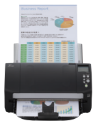
fi-7180 and fi-7160