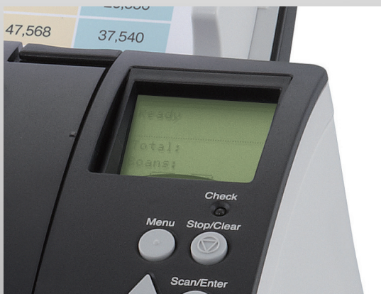
Integrated LCD operating panel

Scanner Central Admin software enable Fujitsu scanners to be managed and maintained from a single location to minimise scanner downtime anywhere on the global system.