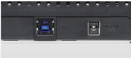
High speed performance through USB 3.0 interface

All four scanner models additionally make use of an ultrasonic sensor that accurately detects multifeed errors where two or more sheets are fed through the scanner at once plus the Intelligent Multifeed Function allows document scan parameters to be applied which enables the sensors to be set up to help identify and subsequently ignore attachments such as sticky notes or items with a photo attached that would otherwise cause disruptions to the scanning process.