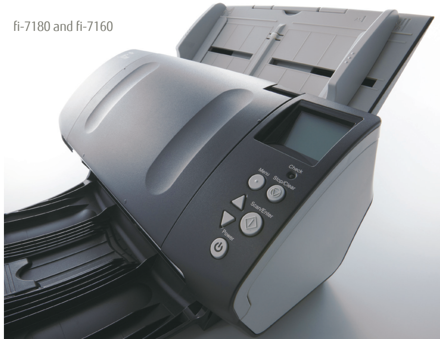
fi-7180 and fi-7160