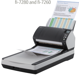
fi-7280 and fi-7260

fi-7160 / fi-7260 – A4 Portrait at 300 dpi 60 ppm / 120 ipm fi-7180 / fi-7280 – A4 Portrait at 300 dpi 80 ppm / 160 ipm Scan mixed batches through the 80 sheet ADF