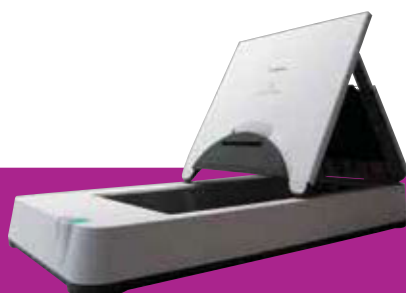
A4 Flatbed Scanner Unit 101

Scan bound books, journals and fragile media by adding the Flatbed Scanner Unit 101 for documents up to A4 or Flatbed Scanner Unit 201 for A3 scanning. Connected by USB, these flatbed scanners work seamlessly with the DR-G1130 and DR-G1100 in a smooth dual-scanning operation that lets you apply the same image-enhancement features to any scan.