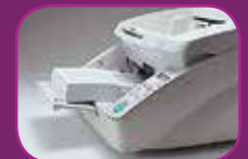
Lowest position (500 sheets)