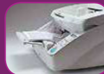
Highest position (100 sheets)

The document feeder has three selectable feeding modes (100, 300 and 500 sheets) that are adjustable according to the volume of the batches being scanned, saving time and increasing overall throughput.