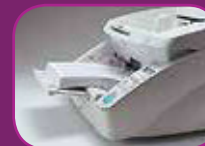
Middle position (300 sheets)