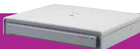
A3 Flatbed Scanner unit 201