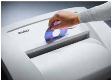
Dahle Waste 106 document shredder