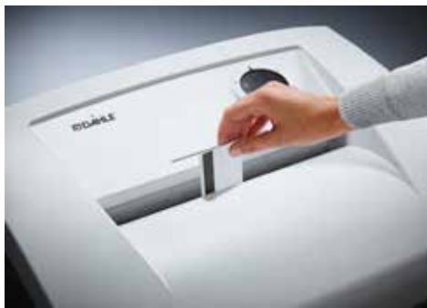
Dahle Waste 106 document shredder