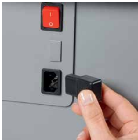
Detachable IEC power plug makes the document shredder quick and easy to move from A to B