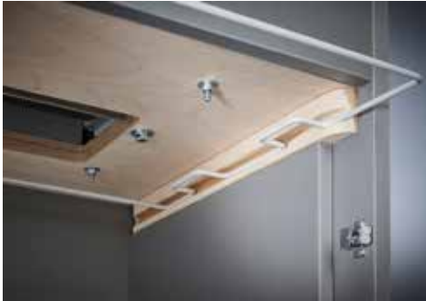
Dahle Waste 106 document shredder