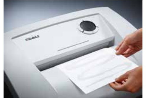
Dahle Waste 106 document shredder