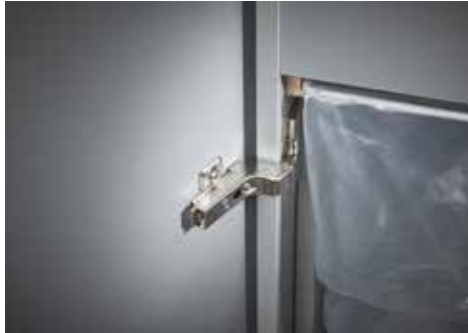
Dahle Waste 106 document shredder