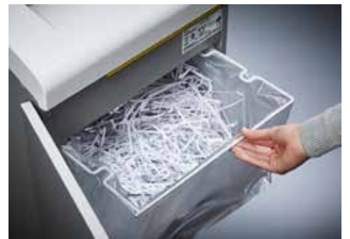
Dahle Waste 106 document shredder