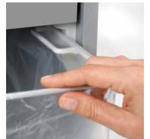
Pull-out rounded top frame that's kind on the fingers when changing the waste bag