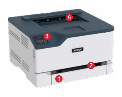
Xerox® C230 Color Printer