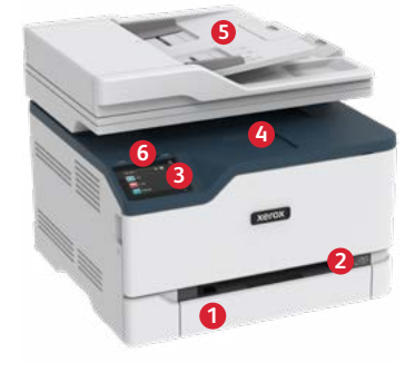
Xerox® C235 Color Multifunction Printer