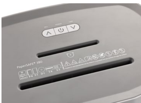
DAHLE PaperSAFE® document shredder 380